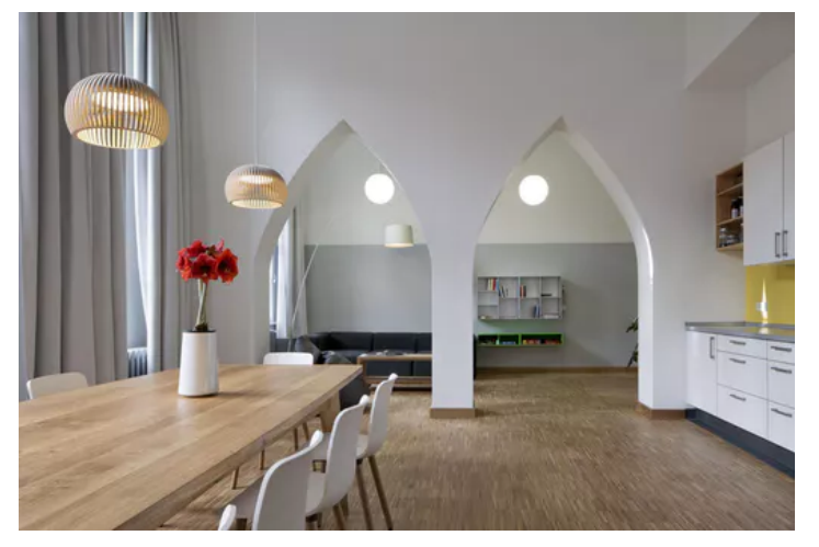
A view of Danziger's design for the Soteria